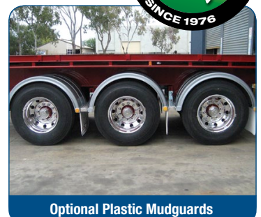
Optional Plastic Mudguards

Discuss your requirements with our sales staff today. They will help you gain the best value from your new Southern Cross equipment.