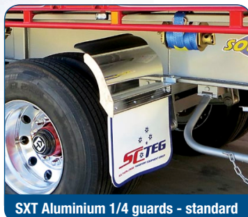
SXT Aluminium 1/4 guards - standard