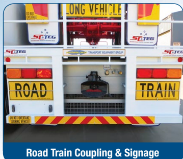
Road Train Coupling & Signage

The Strength to weight ratio of Southern Cross Flat Top Semi-Trailers provides operators with in-service reliability and a trailer manufactured to cope with Australia's harshest conditions.