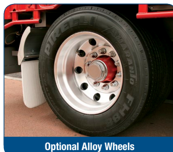
Optional Alloy Wheels