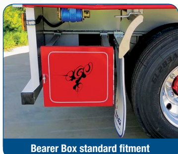
Bearer Box standard fitment