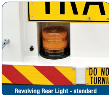
Revolving Rear Light - standard