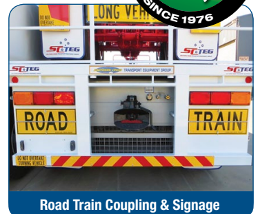
Road Train Coupling & Signage

Discuss your requirements with our sales staff today. They will help you gain the best value from your new Southern Cross equipment.