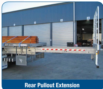
Rear Pullout Extension