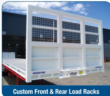
Custom Front & Rear Load Racks