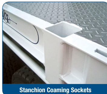
Stanchion Coaming Sockets