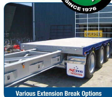
Various Extension Break Options

Discuss your requirements with our sales staff today. They will help you gain the best value from your new Southern Cross equipment.