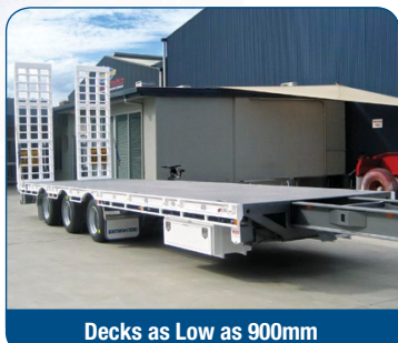
Decks as Low as 900mm