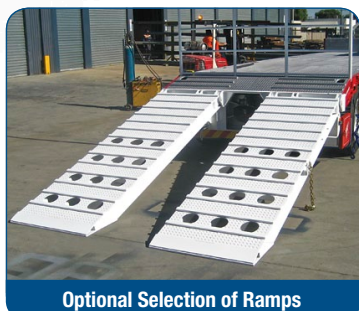
Optional Selection of Ramps