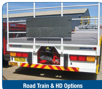
Road Train & HD Options