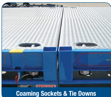
Coaming Sockets & Tie Downs