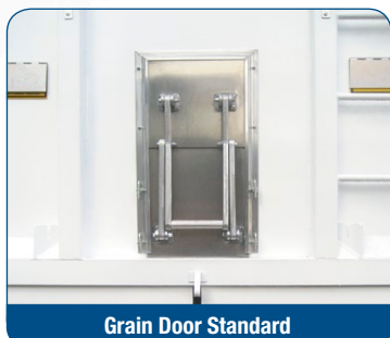
Grain Door Standard