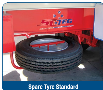
Spare Tyre Standard