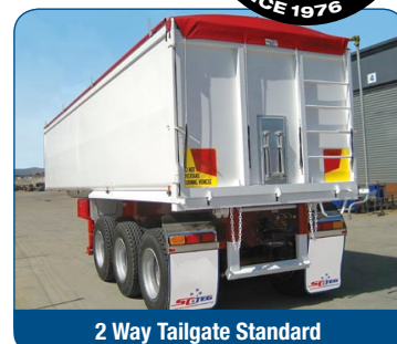
2 Way Tailgate Standard

Discuss your requirements with our sales staff today. They will help you gain the best value from your new Southern Cross equipment.