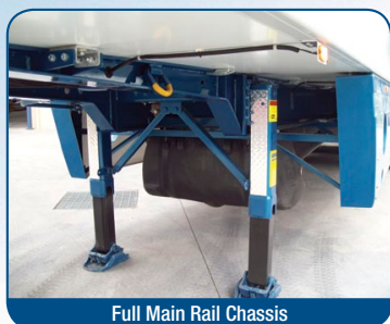
Full Main Rail Chassis