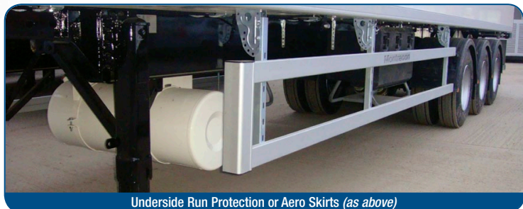
Underside Run Protection or Aero Skirts (as above)