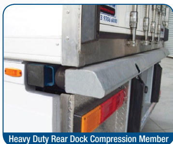
Heavy Duty Rear Dock Compression Member