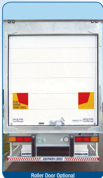
Roller Door Optional

Fully tailored to meet not just today's but tomorrow's demanding freight handling needs, designed to deliver the strongest and longest lasting outcomes, with the most advanced thermal qualities on the market today ensuring correct temperature control for your customers freight. Built to promote your image and status in the transport industry.