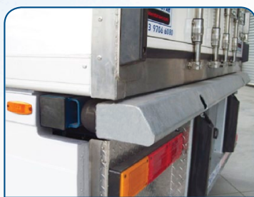
Heavy Duty Rear Dock Compression Member