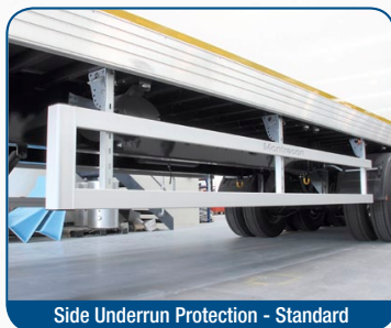
Side Underrun Protection - Standard