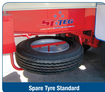
Spare Tyre Standard