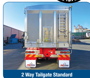
2 Way Tailgate Standard

Discuss your requirements with our sales staff today. They will help you gain the best value from your new Southern Cross equipment.