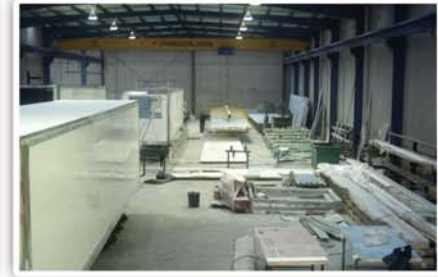
Victorian Manufacturing facility located at Dandenong South